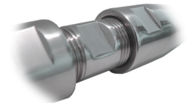
The In-Line Link benefits from the unique crown ring which is used in all HI-MOD compression terminals. See the compression terminal pages for more information.