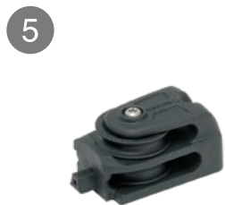
Genoa end control