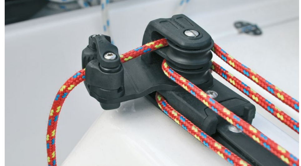
End control with cam cleat