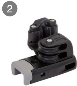
End control, Port