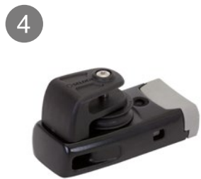
End control, single sheave