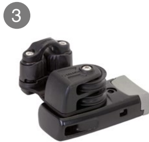
End control, Starboard