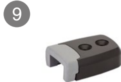
End stop, heavy duty