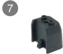
high beam adaptor