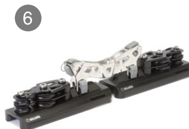
6 Main car with double toggle 8:1