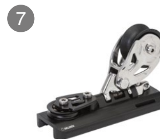
7 Genoa car single sheave