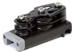
End control double fiddle