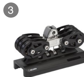
3 Main car with toggle