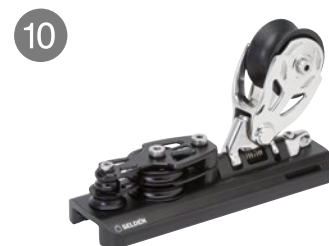
10 Genoa car fiddle/becket