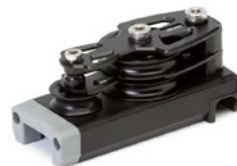
End control double fiddle/becket