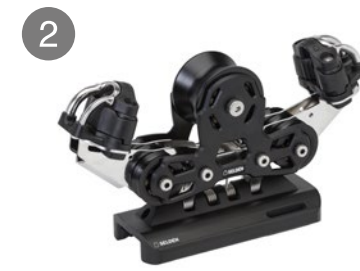
2 Main car fixed block with cam