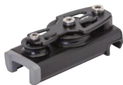
End control fiddle