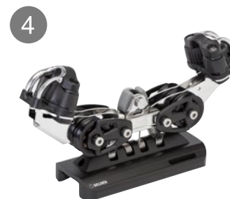
4 Main car with toggle and cam