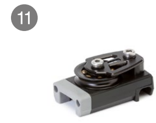
11 End control single sheave