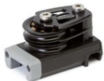
End control double sheaves