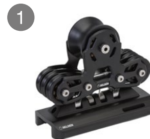
1 Main car fixed block

Seldén system 30 Performance can be used for boats up to approximately 45'. See all combinations at pages 74-79. For more information about dimensioning, see page 104.