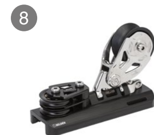
8 Genoa car double sheaves