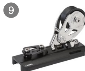
9 Genoa car with becket