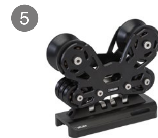
5 Main car fixed double sheaves